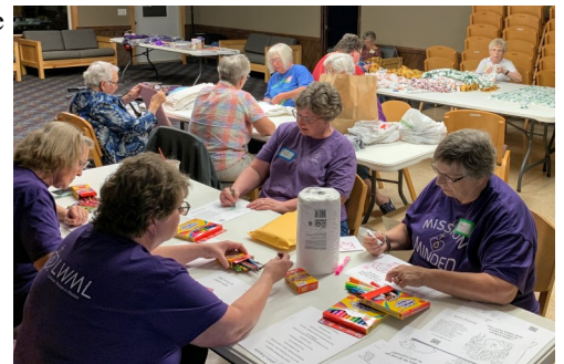
2023 LWML Retreat coloring cards for Phil’s Friends, a non-profit that provides care for cancer patients

Another specific day to look forward to this “off-season” is our Fall Workday. Our Fall Workday is scheduled for Saturday, November 2nd. We are planning on doing some maintenance to fix things up around the horse activity areas. Additional information will be provided as that day gets closer. Any help with this will be greatly appreciated and will be of great assistance primarily to our summer program as the horses are a big attraction and Horse Camp is our most popular camp!