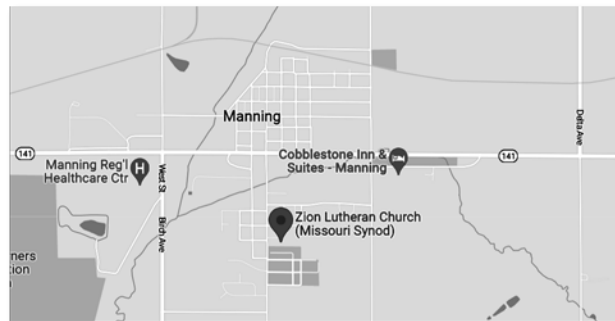
Map of Manning, IA

Registration fee is $45.00 (includes all materials and lunch) Register before September 1 and take $10 off your registration fee!