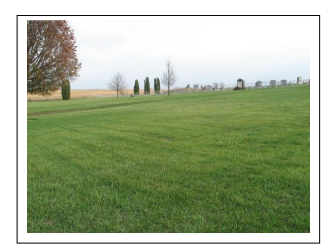
Where church, parsonage & school stood