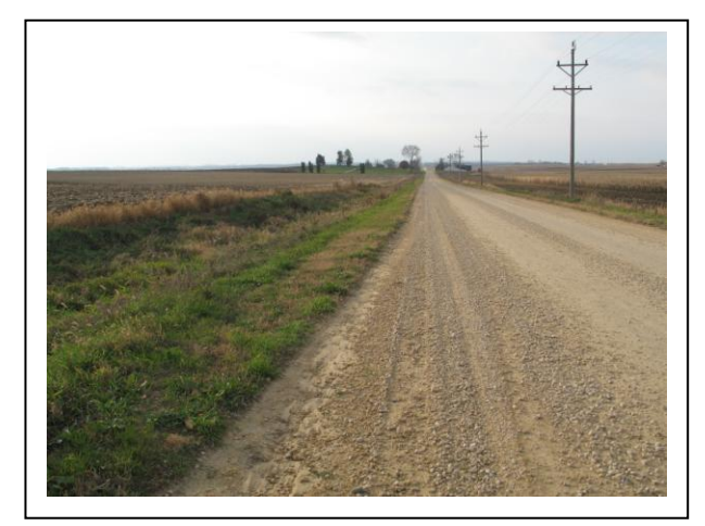
Approaching Site from North

I made a trip to Olive Township to see for myself what evidence still remained of Immanuel Lutheran's existence. From Calamus, I drove about a mile and a half east on U.S. Highway 30, took a right turn and drove south on paved road Y52. Shortly after passing the Norwegian Lutheran Church on the left side of the highway, the pavement turns east. At that turn, I got off the pavement and continued south on a gravel road. In the distance, on the left side of the road, one can see some trees on the left side of the road where Immanuel Lutheran once stood. All that remains is the open ground on the west side of their property where the church, school and parsonage once stood. The east end of the property is occupied by the church cemetery.