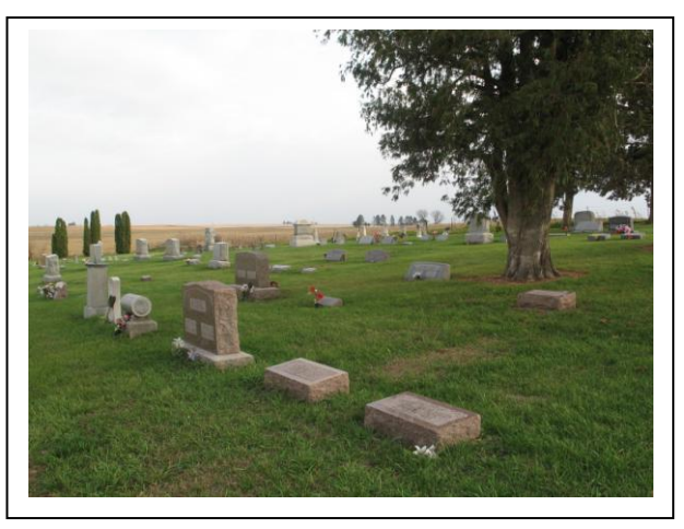
Viewed from south end of Cemetery