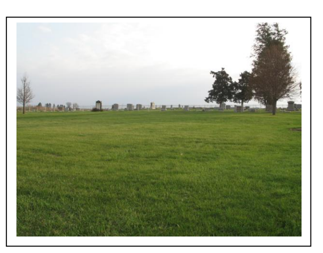
Viewed from SW corner of Site