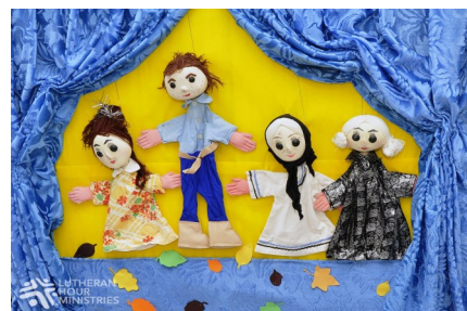
Homeless girl finds hope at puppet show in Myanmar