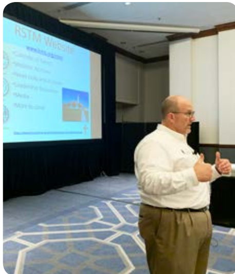
⬆ The plenary sessions were well-attended and received great feedback.