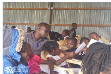
LHM-Kenya VBS Reaches 100 Children