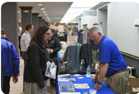
⬆ The conference was well-attended, and the food was excellent!