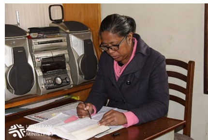
Booklets help strengthen sick woman's faith in Madagascar

Directions: Take I-380 until exit 10 (Swisher, Shueyville) and head east on 120 th St. [F12] until stop sign. Turn right onto NE Curtis Bridge Rd. and follow it until Sandy Beach Rd. Turn left onto Sandy Beach Rd. and follow it to the Camp. Watch for Camp signs.